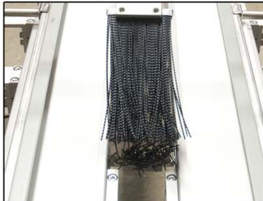
Shown with Stainless Steel Construction